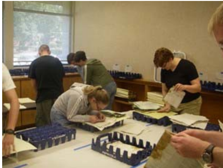
Students from LSU's School of Library and Information Science volunteer their time in the conservation room.

After the storm, local community groups and individuals got busy dealing with the swarm of evacuees, limiting available resources. Housing evacuees, assisting at shelters, collecting supplies, and providing necessary information strained the shared resources of commodities, transportation and office space necessary to effectively deal with the challenge. Cooperation crossed personal boundaries into the institutional realm. Within a week of the hurricane, the Archdiocesan Archives of New Orleans had moved in to share the offices of the Baton Rouge Diocesan Archives.