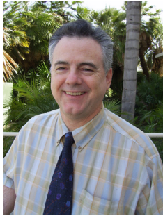
Louis "Studs" Terkel, 1912–2008

Studs Terkel, the spiritual father of the oral history movement, died peacefully in his Chicago home on October 31, 2008, at age of 96. Terkel was one of the best known and most respected oral historians. An especially vivid memory I have was the remarkable OH-Section-endorsed program in 2007 featuring him in a special session: "Free Speech, Free Spirit: the Studs Terkel Center for Oral History" (see OH-Section Newsletter, Vol. 4, Issue 1). It seems very likely that those who attended that session -- including our Section members -- will always cherish the memory of Studs and SAA in Chicago. He was always known as a "free spirit" at WFMT, his flagship radio station, and at the Chicago History Museum