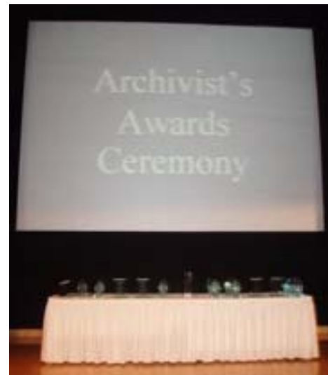
Right: Awards are lined up, ready for presentation, prior to the start of the State of the Archivist Address & Awards Ceremony .