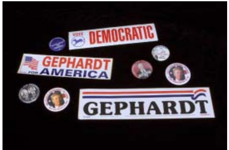
A sample of Gephardt campaign memorabilia