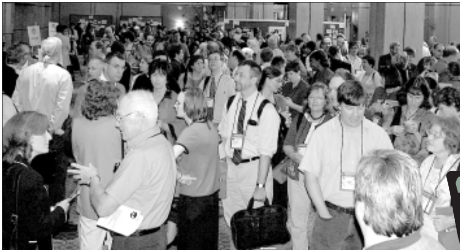
Scene at the ribbon cutting ceremony to open the 2002 International Archives and Information Technology Exposition.