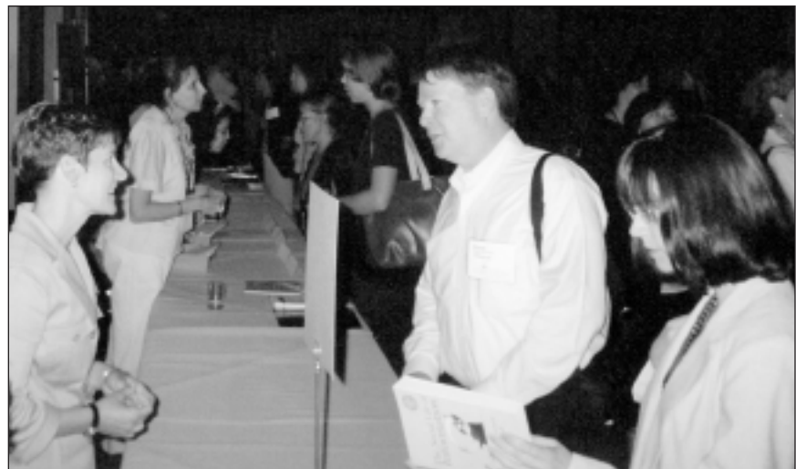
Scene at the 2003 International Archives and Information Technology Exposition.